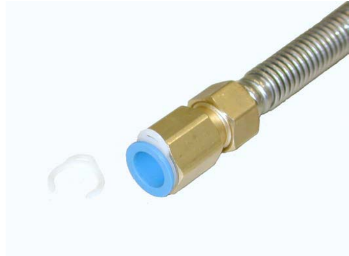
Figure 1: Metal Flexible Hose With Push-On Couplings and C-Clip

Hoses made of flexible stainless steel of various lengths mated to Barcol-Air's exclusive push-on type end fittings. The hoses provide an oxygen tight loop that does not require automatic venting. standard diameter is 12 mm.