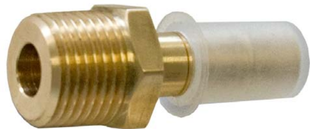
Figure 4: Detail Of Header Nipple 1/2" NPT

Barcol-Air brand header nipples complete the integrated approach to chilled ceiling design. Nipples can be fabricated into piping circuit headers or manifolds as desired by the designer. The use of one piece, precision-machined brass ensures that the system will be leak tight and installed with a minimum of difficulty. It is designed to receive the 12 mm push on coupling of the flexible hose at one end & terminates a 1/2" male thread at the other end.