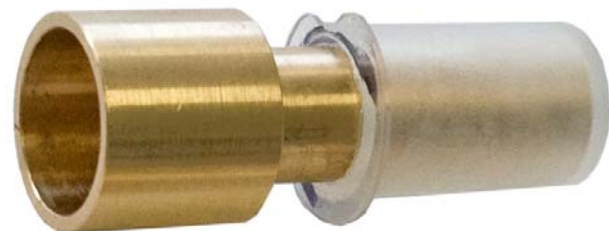
Figure 6: Detail Of Header Nipple 5/8 IS, Solder Cup