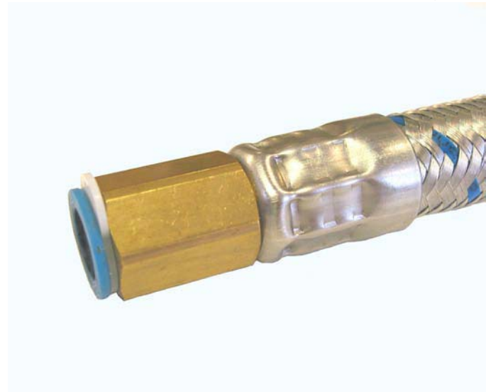
Figure 2: Brom/Butil Flexible Hose With Push-On Couplings and C-Clip

The hose has a Brom/Butil core, a braided stainless steel jacket mated to Barcol-Air's exclusive push-on type end fittings.