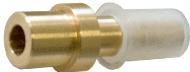
Figure 5: Detail Of Header Nipple 5/8" OD, ProPress

Alternatively a Nipple with 5/8" ID solder cup or 5/8" OD ProPress can be delivered